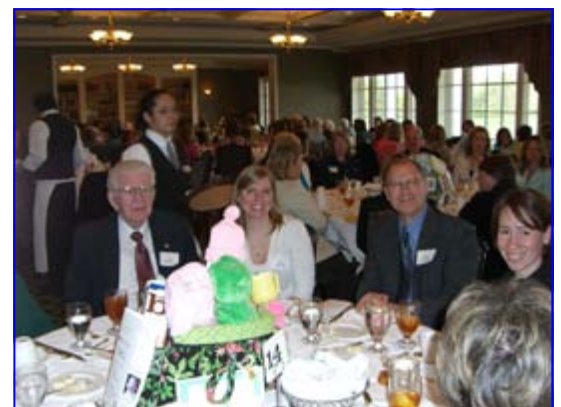
2008 Annual Luncheon