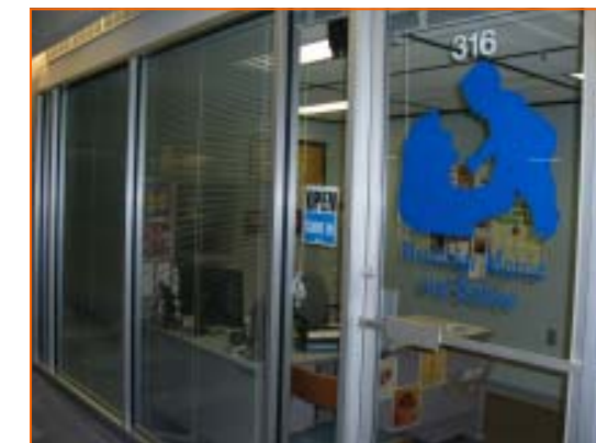
Our new entrance at Suite 316 !!

Parking in St. Joseph Hospital Parking Garage Validated by Healthier Moms and Babies